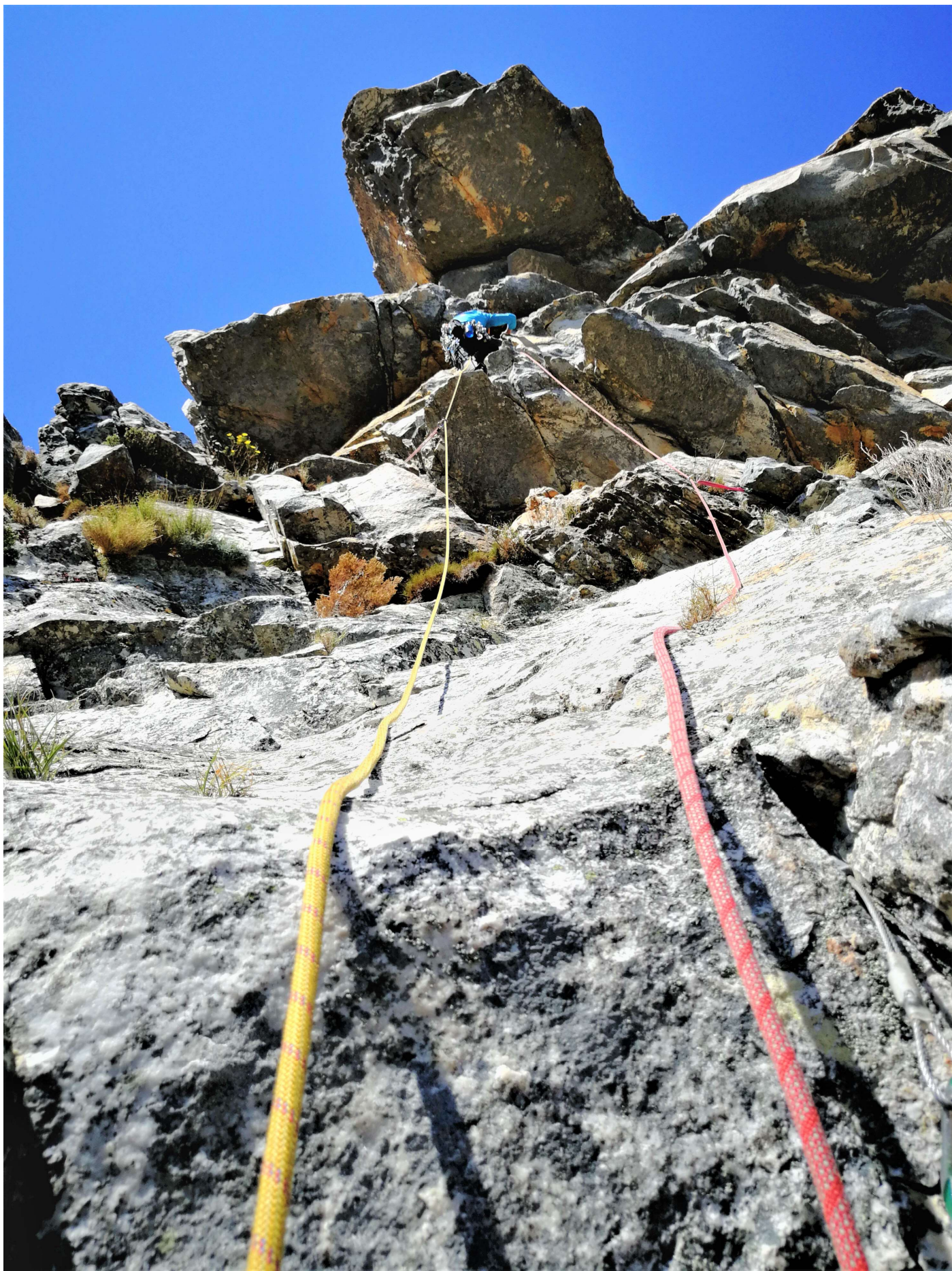
Brent just above the crank move on pitch 7 of Terrific Time. Photo. Charles Edelstein Sep 2017